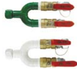
Two-way distributor (U-type)